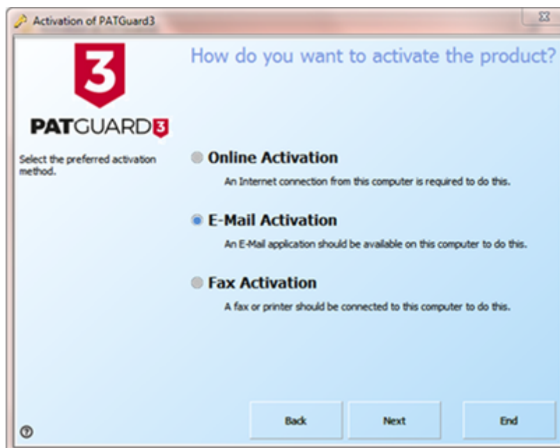
Activation Screen 2

3. Select E-Mail Activation or Fax Activation on the following screen and click next.