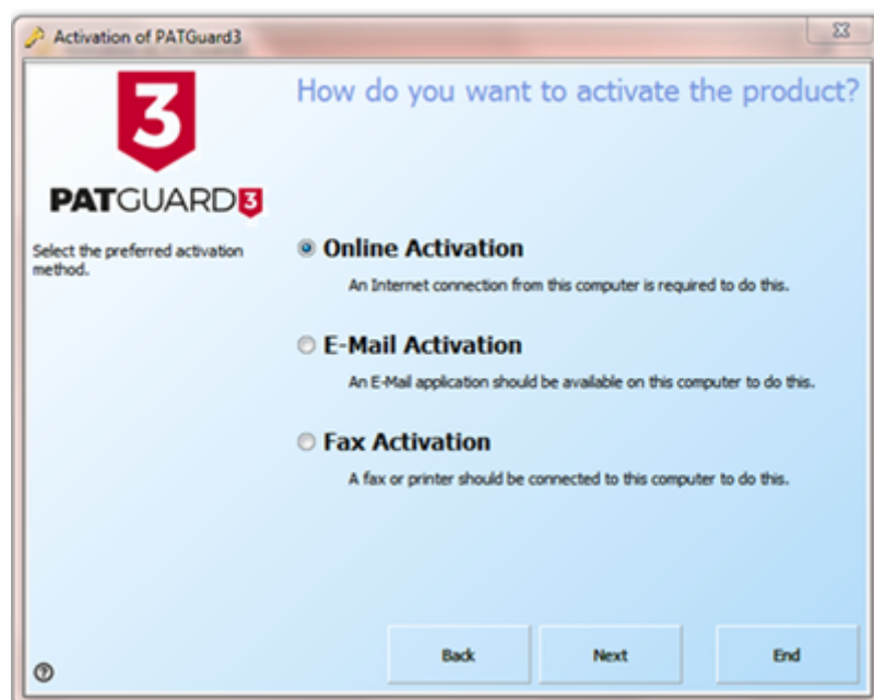
Activation Screen 1