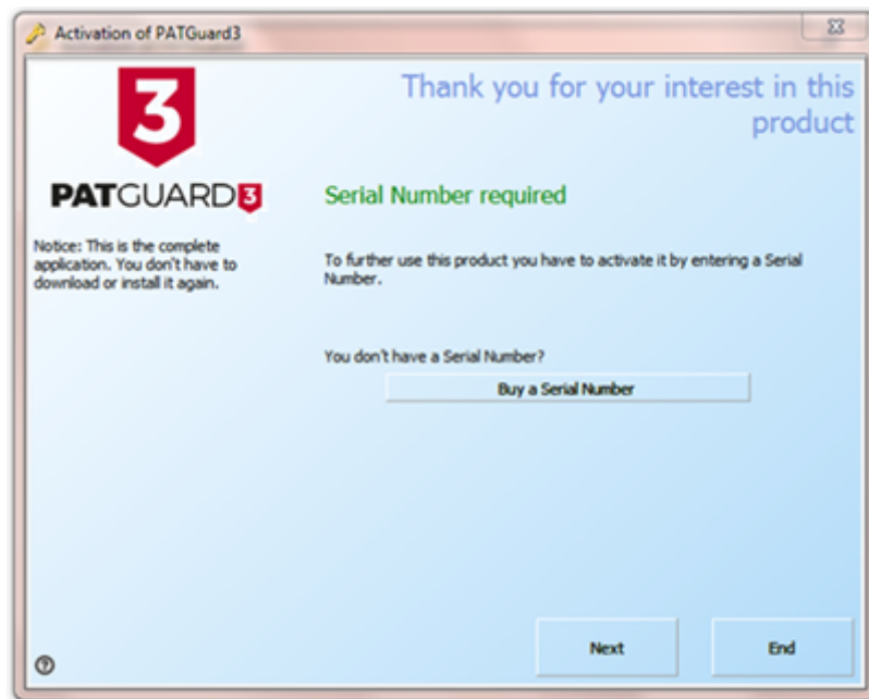
Activation Screen 1

3. Select E-Mail Activation or Fax Activation on the following screen and click next.