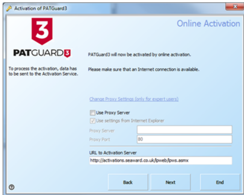
Proxy server details

for expert users). By default the Proxy Server settings will be the same as those set in Internet Explorer. To change the Proxy Server settings, select Use Proxy Server and enter the details in the Proxy Server and Proxy Port boxes.