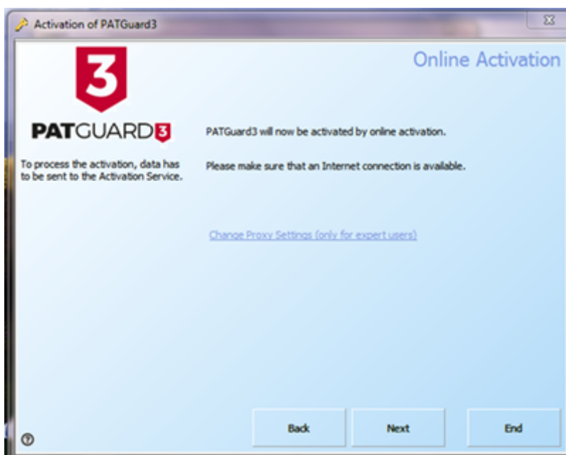
Activation Screen 3

4. PATGuard 3 is now ready to be activated. If you use a proxy server to access the internet you will need to enter these details on the following screen by clicking Change Proxy Settings (only for expert users). See Entering Proxy Server details if required, otherwise click next.