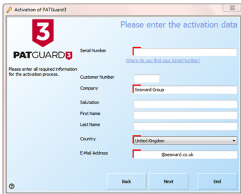
Activation Screen 2

4. PATGuard 3 is now ready to be activated. If you use a proxy server to access the internet you will need to enter these details on the following screen by clicking Change Proxy Settings (only for expert users). See Entering Proxy Server details if required, otherwise click next.